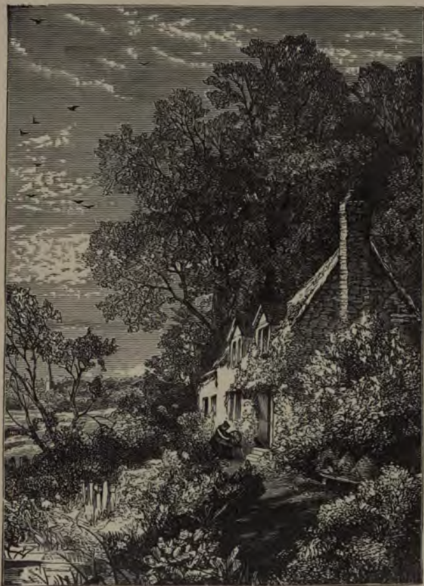
“Mine be a cot beside the hill.” Page 8r.